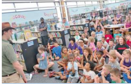
Repcro Draws Large Crowd