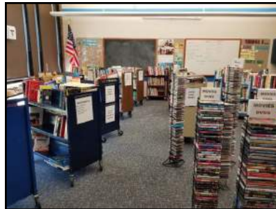
Used Book Sale