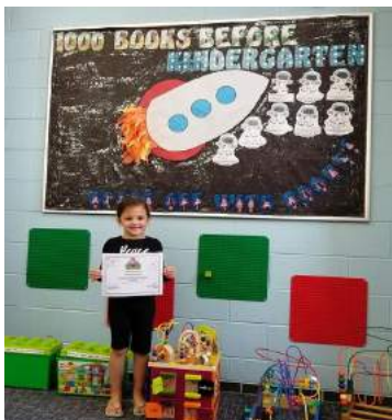
1,000 Books Before Kindergarten Graduate