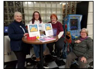
Friends Bowling Fundraiser