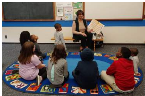
Money Smart Week 2019