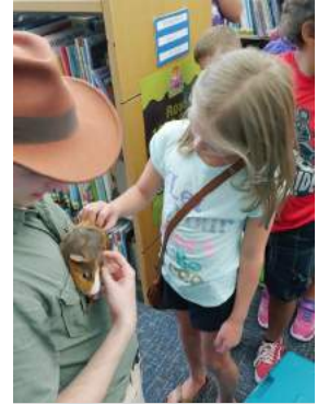
Petting a guinea pig