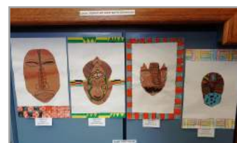
Student Art from Barth Elem