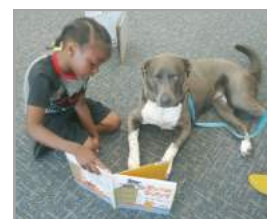
Reading to Fur Angels