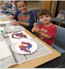
A Call for Art