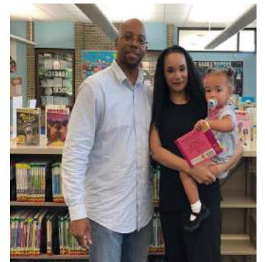
1,000 Books Before Kindergarten Graduate