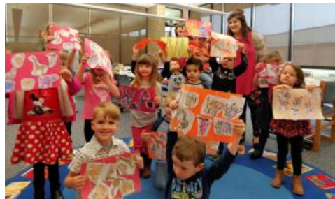
St Stephen's Preschool Visit