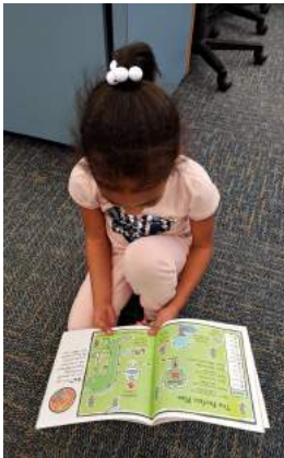
I Got Caught Reading!