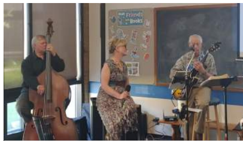
Jazz in the D Concert