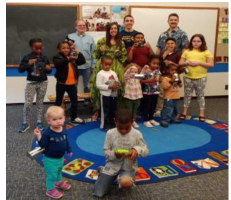
Earth Day 2019